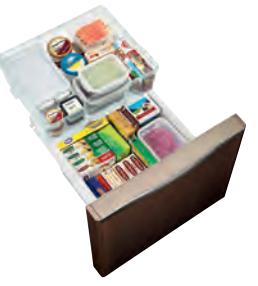
Features a double-deck construction for easier organisation of frozen food items