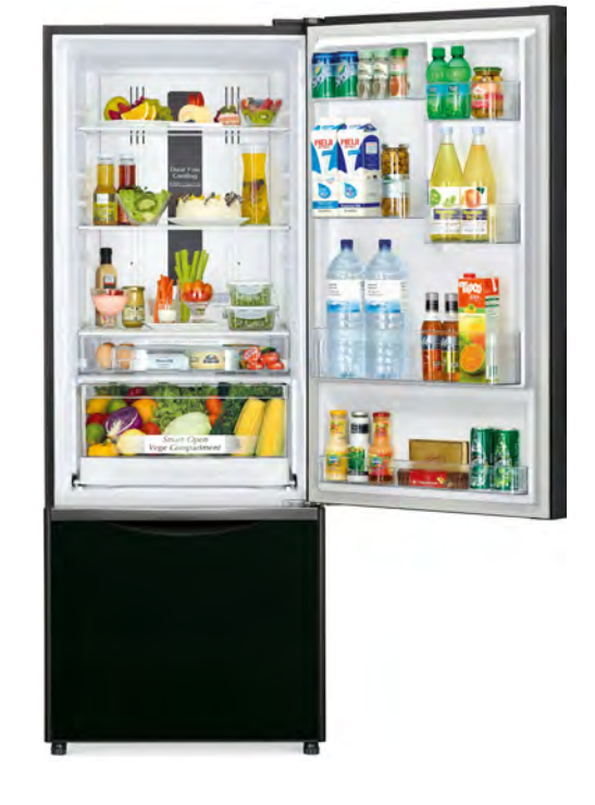
R-B500PT6GBK Glass Black