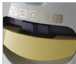
Variable surface adjustment