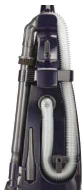
Convenient on board tools and hose extension