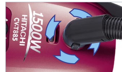
360° Swivel hose