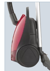
Hose stand for convenient storage