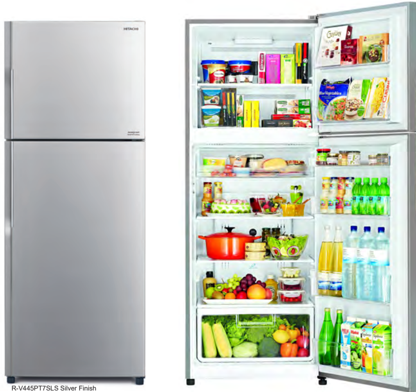
R-V445PT7SLS Silver Finish