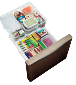
Features a double-deck construction for easier organisation of frozen food items.