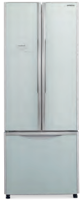
R-WG550PT2GS Glass Silver