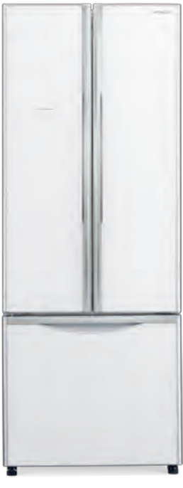
R-WG550PT2GPW Glass Pure White