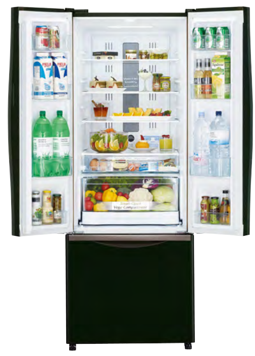
R-WG550PT2GBK Glass Black