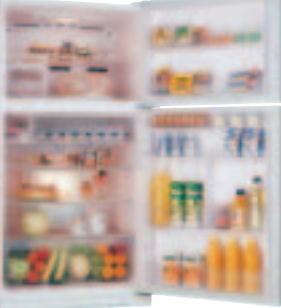
550L – Pure White R550ET3